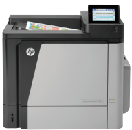
HP Color LaserJet Enterprise M651dn