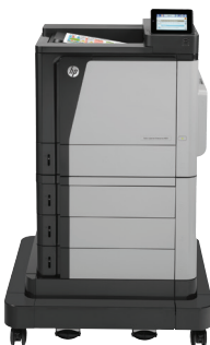
HP Color LaserJet Enterprise M651xh