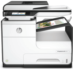
HP PageWide Pro 477dn Multifunction Printer

Ultimate value and speed—HP PageWide Pro delivers the lowest total cost of ownership and fastest speeds in its class. 1,2 Get quick two-sided scanning, plus best-in-class security features and energy efficiency. 3,4