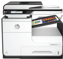
HP PageWide Pro 477dw Multifunction Printer