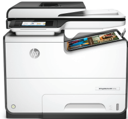
HP PageWide Pro 577dw Multifunction Printer