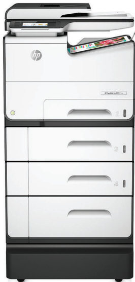
HP PageWide Pro 577z Multifunction Printer