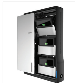
Zip12 Charging Wall Cabinet