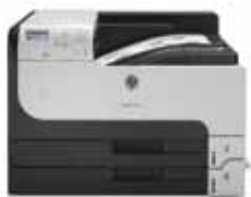
(HP LaserJet Enterprise 700 Printer M712dn)